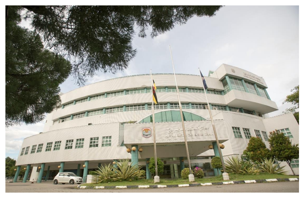
The Royal Customs and Excise Department headquarters at Jalan Menteri Besar

For Brunei Darussalam, the Royal Customs and Excise Department under the Ministry of Finance has been commissioned to implement the Brunei Darussalam National Single Window. It aims to transform the business functions into an integrated electronic process which allows the trading community to submit applications electronically to the Royal Customs and Excise Department (RCED) for processing and approval. Apart from facilitating the import and export of goods across borders, the BDNSW also aims to improve the collection of revenues via integration with e-Payment Gateway, a flagship project under the Ministry of Finance. Payment has also been made easy by leveraging on internet banking where the Royal Customs and Excise Department has embarked on.